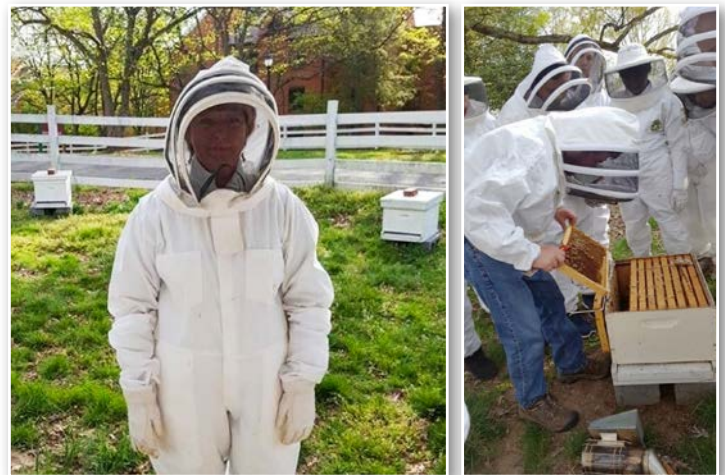
Our visit to an apiary at George Mason University

There are so many ways that you can help end plastic pollution, but I would suggest you start off with just one or two habits and then keep adding on as many as you can handle. Here are a