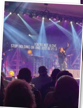
We are huge Casting Crowns fans. Mart Hall always "v delivers a timely message in a a