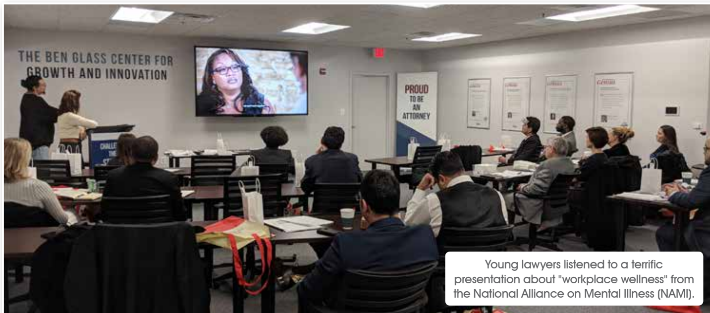
Young lawyers listened to a terrific presentation about "workplace wellness" from the National Alliance on Mental Illness (NAMI).