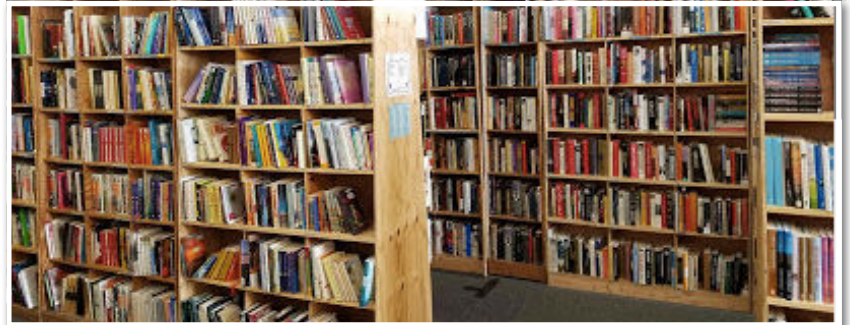
My favorite used book store is McKay's Used Books in Manassas, VA.

store because it is a good thing to do. (Businesses must live or die because they produce something people want, not out of charity.) I tell you to go wander a bookstore because I guarantee that you will find books that are of interest to you that you never would have found just by searching Amazon. A bookstore aisle will take you places and lead you to books and authors that the Internet just can't match.